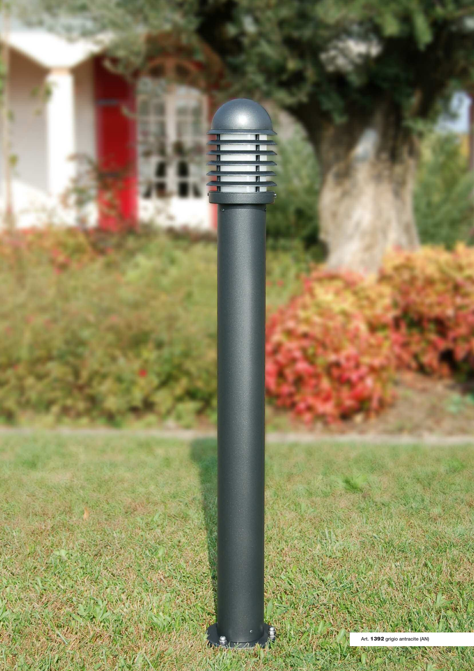
Art. 1392 grigio antracite (AN)